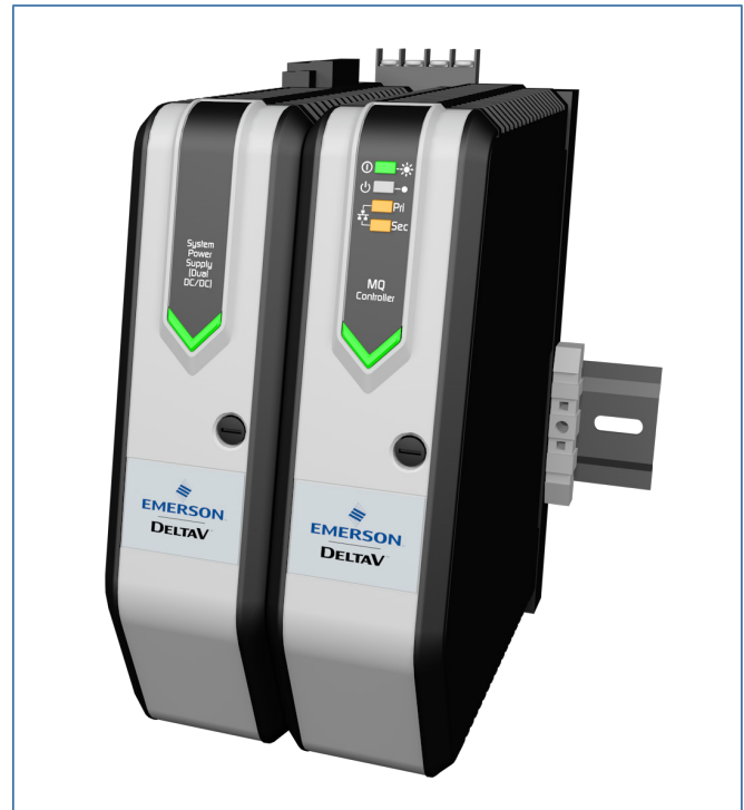
The MQ Controller.

Mounting. This plug-and-play system structure provides modular system growth with a single controller and can be mounted in a Class 1, Div 2 or ATEX Zone 2 environment. Refer to the System Power Supplies and I/O Subsystem Carriers product data sheets for additional information.